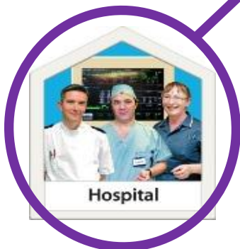
Work with people in hospital