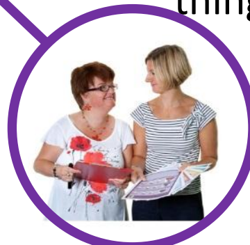
Support staff and carers