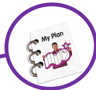
good personal plans for when things change