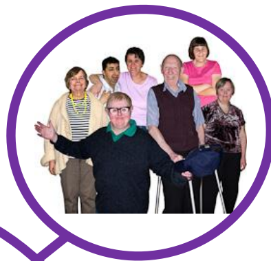
Know people in our area