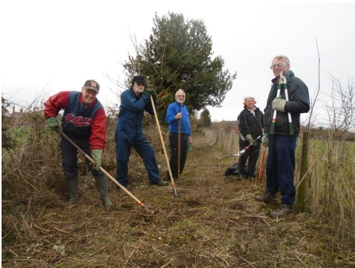
Stratford Ramblers at Wellesbourne