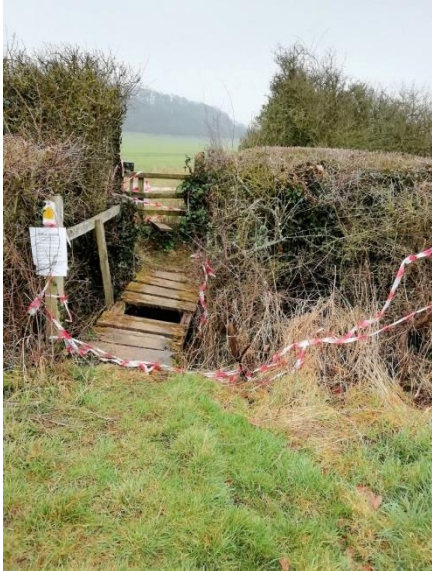
Aston Cantlow AL90 ditch crossing before