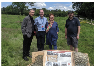
Coventry Peace Orchard

To mark the 75th anniversary of D-Day, and celebrate the work of local schools, a Peace Picnic was held at the Coventry Peace Orchard in Coundon Hall Park on the afternoon of 6th June 2019.