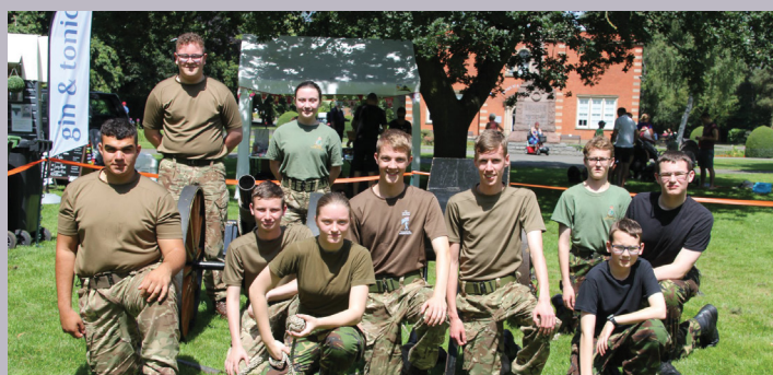
121 ATC Gun Team

Warwick AF Day was again held at St. John's House and organised by Warwick District Council and the Royal Regiment of Fusiliers Museum. There were displays from WWII and Home Guard re-enactors as well as paintball, climbing wall and circus skills for children and families. Kineton Station demonstrated their Bomb Disposal capabilities and new STEM (Science, Technology, Engineering, Maths) equipment for use with schools and community groups.