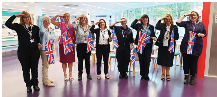
Solihull MBC Staff Sing-a-long with a medley of WWII tunes

Solihull MBC held various displays on the Armed Forces Covenant and a drop in event for people to find out more about ancestors who served in the Armed Forces. Library staff were available to help and support people to get free access to Library wifi and SMBC subscriptions to Ancestry and Find My Past.