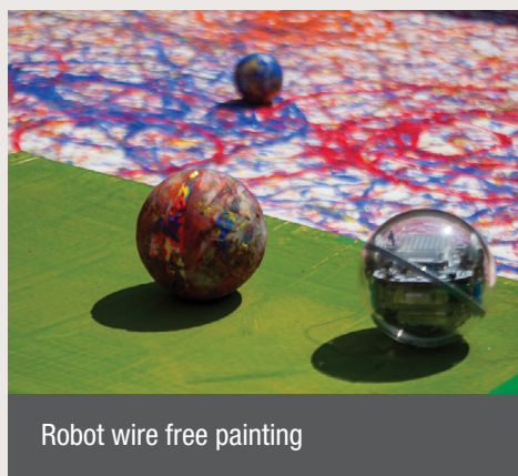
Robot wire free painting

These events are on top of support to cadets, school enrichment days, after-school STEM clubs, career days and school interview sessions.