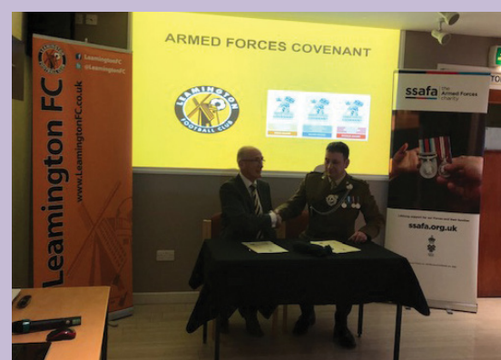
Leamington FC signs the Covenant

The Club are supporting the employment of veterans, offering flexibility to Reservist employees and families of serving personnel and taking part in the Tickets for Troops Initiative.