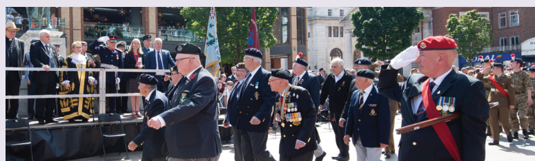
Lord Mayor Cllr Linda Bigham taking the salute

A short video of the event has been produced by local film maker jam-am and can be found at https://youtu.be/LYwQkrMyVY0