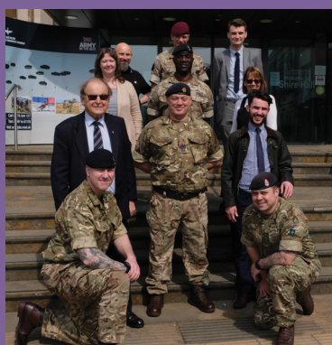
Reserves event, Shire Hall

As part of Warwickshire County Council's (WCC) commitment to the Armed Forces Covenant, WCC hosted an Army Reserve recruitment event on Wednesday 17th April. This was open to all WCC staff for them to find out about the opportunities in the Army Reserve locally.