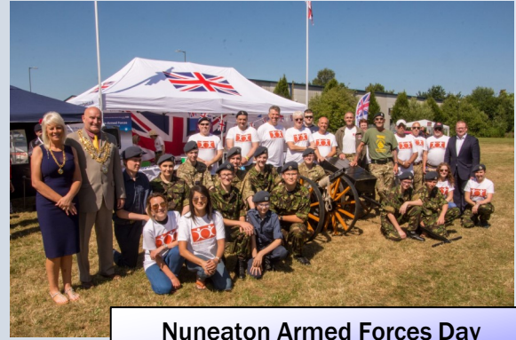
Nuneaton Armed Forces Day