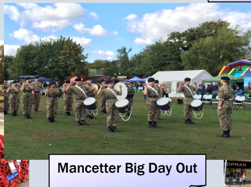
Mancetter Big Day Out