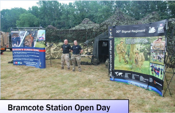
Bramcote Station Open Day