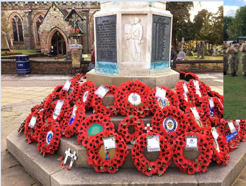
St. Alphage, Solihull—WWI 100th Anniversary