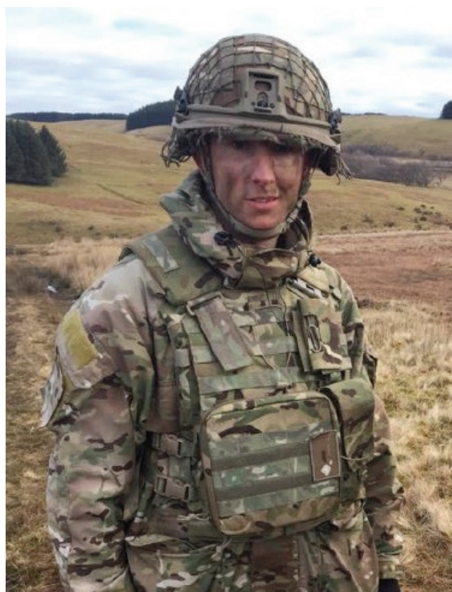
Enjoying the scenery in Brecon Beacons