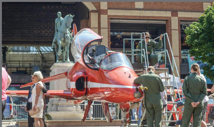
A Red Arrows Hawk in Godiva Square, Coventry