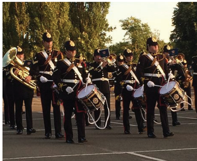
Band of the Royal Logistic Corps

'Beating Retreat' comes from medieval times and was used to tell tavern keepers to close their taps and serve no more drinks to soldiers. This would have been with the firing of guns or beating of drums. Today it is a ceremonial occasion and Kineton Station had its 'Beating Retreat' in the evening of 24th July as part of a community engagement event.