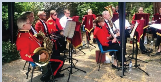
Band of the Royal Regiment of Fusiliers

St. John's House is the home of the Royal Regiment of Fusiliers Museum which was open for free on the day.