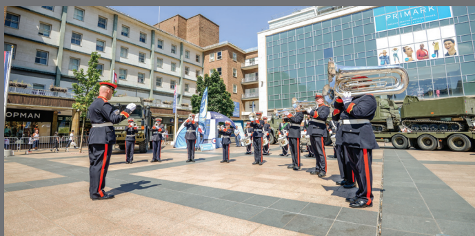
RAF Band in Godiva Square, Coventry