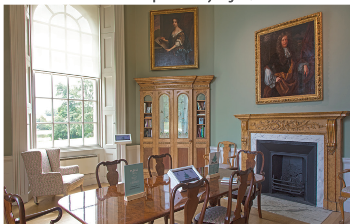
Women's Library at Compton Verney

Further details at www.comptonverney.org.uk/