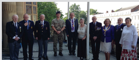
Warwick DC flag raising at Leamington Spa Town Hall

As well as celebrating the tireless work of our Armed Forces to keep us safe, we are continuing to work hard with our partners in the Armed Forces Covenant partnership for Warwickshire, Coventry and Solihull to provide services and assistance to Armed Forces personnel and their families."