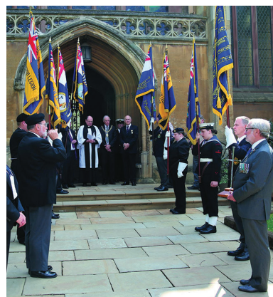
HMS Coventry memorial service at Holy Trinity Church, Coventry

Over 200 people attended a memorial service for the sinking of HMS Coventry during the Falklands Conflict of 1982. This took place on the 25th May at Holy Trinity Church, Coventry and was particularly poignant coming just 3 days after the Manchester Arena bombing.