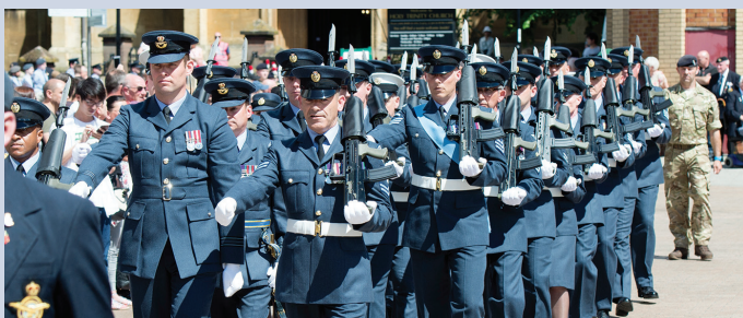
605 Squadron RAF Reserve parading in Coventry on Armed Forces Day

reconciliation around the world." 605 Squadron was previously granted the Freedom of Coventry 65 years ago and, following the re-formation of 605 Squadron in 2014 the commemorative silver rosebowl was returned to them.