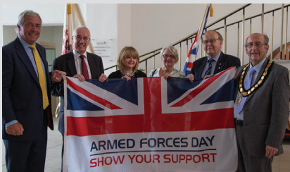
Warwickshire County Council Fly the Flag for Armed Forces Day