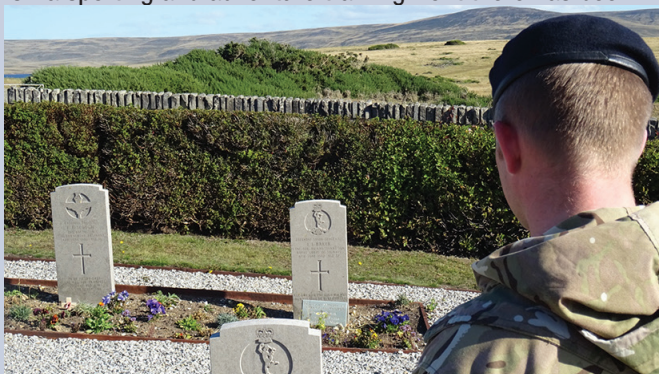
Soldier from 30 Signal Regiment at a Falklands cemetery

On a sporting and adventure training front there has been