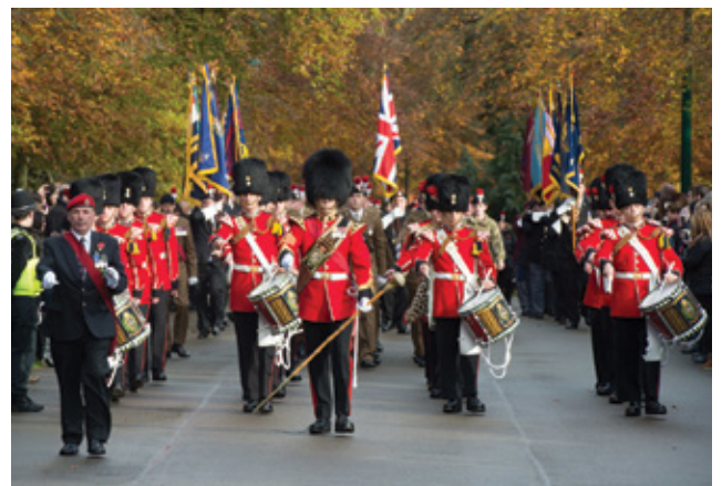
First Battalion, The Royal Regiment of Fusilier Corps of Drums

The day also marked the 70th anniversary of the granting of the Freedom of Entry to the Royal Warwickshire Regiment to Coventry in 1946. This year, the parade was led by their successors, the Royal Regiment of Fusiliers.