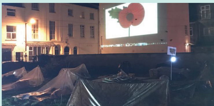
Members of the public in the shelters built by the soldiers

A sleep out in the grounds of All Saints Parish Church, Leamington was a huge success thanks to a partnership approach and some help from local military units. 'Helping Hands', a charity supporting homeless people and those on a low income in Leamington Warwick and Kenilworth, chose to hold its 'Sleep Out' on Armistice Night, in recognition that some ex-Armed Forces personnel can become homeless and find themselves sleeping rough.