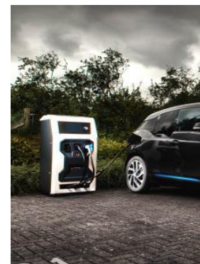
Rapid 50kW charger