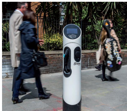
7kW charging point post