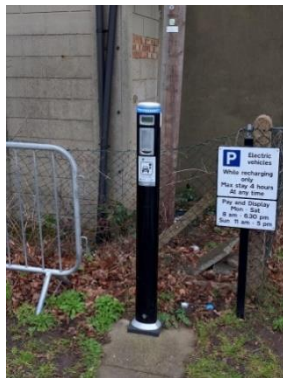
3kW charging point