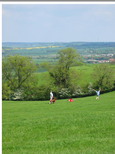
Family enjoying Burton Dassett County Park, one of eight country parks in Warwickshire

The purpose of this information sheet is explain that although the 'Right to Roam' does not permit the public to wander freely over agricultural land or private premises, there are still plenty of opportunities to enjoy the Warwickshire countryside.