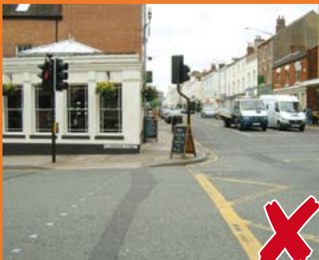
Only one 'A' board permitted