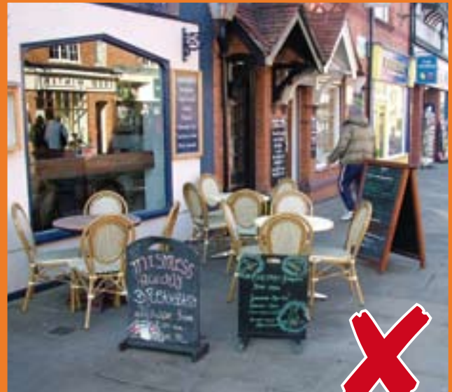
Bad practice - excessive obstructions to pedestrians