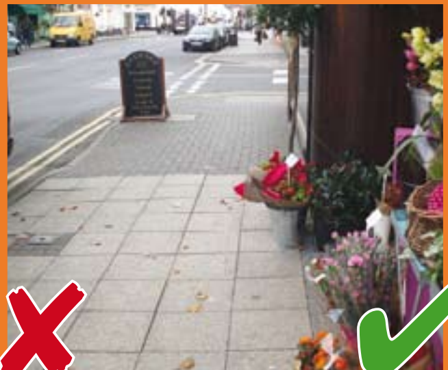
'A' board near crossing point