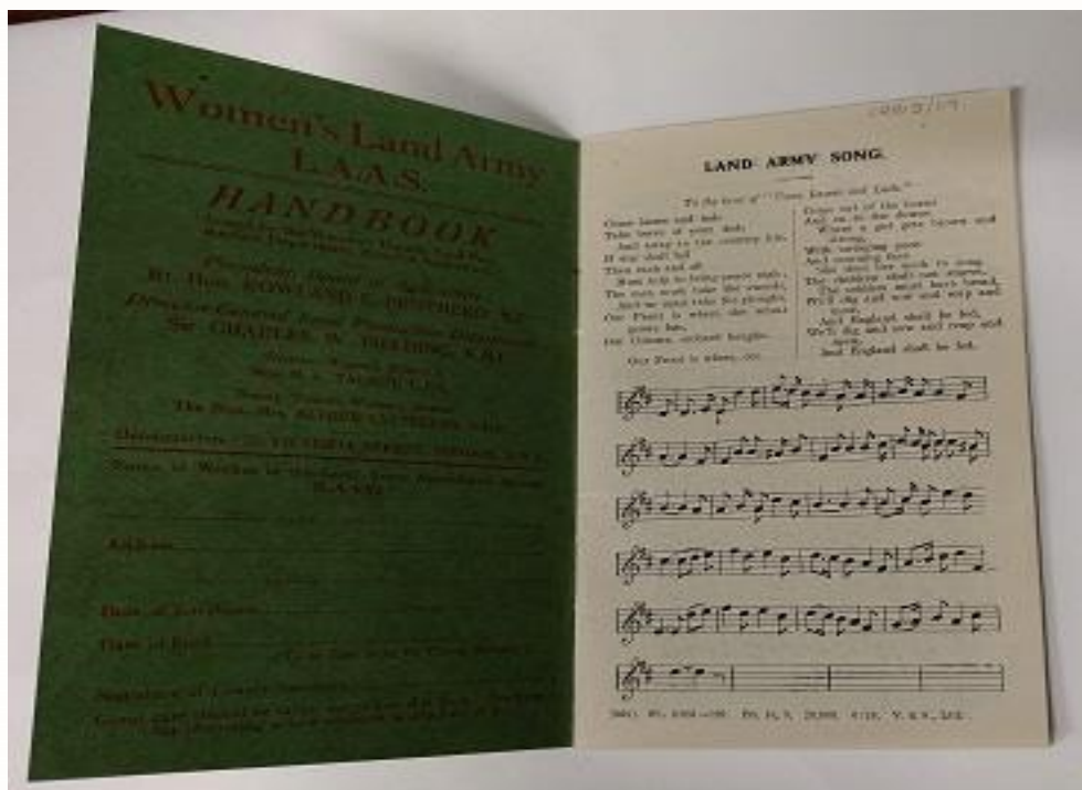
Warwickshire County Record Office. The Women's Land Army Handbook . Document reference CR0815/119

It covered information on how the women should dress and behave; for example, "Noisy or ugly behaviour brings discredit, not only upon yourself but upon the uniform and the whole Women's Land Army", as well as providing practical guidance on how to look after their uniforms! 4