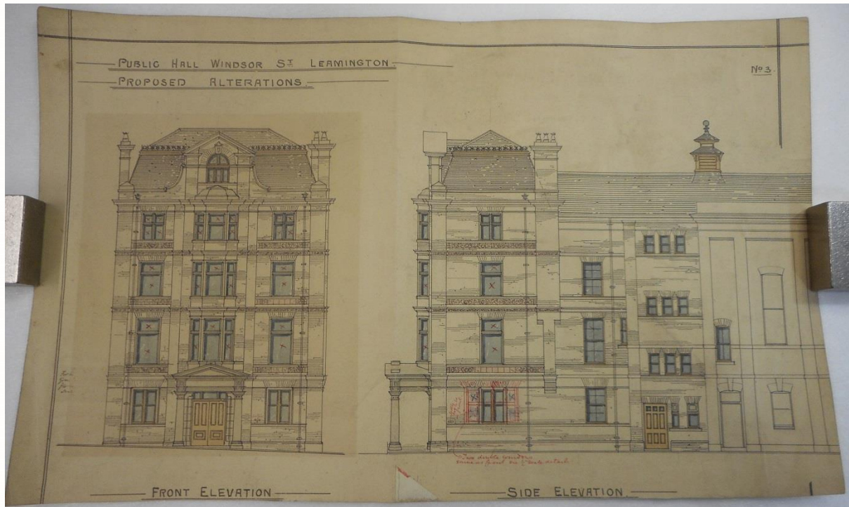
Proposed alterations to the Public Hall on Windsor Street, Warwickshire County Record Office CR634/9/10

January's document of the month takes us back in time to Windsor Street in Leamington Spa during the Victorian era. The document in question is a plan created in 1884 for alterations to the Public Hall which once stood on Windsor Street. Today the street is pleasant but fairly unremarkable, however the buildings, now demolished, were once examples of Leamington's best architectural, cultural and enterprise landmarks.