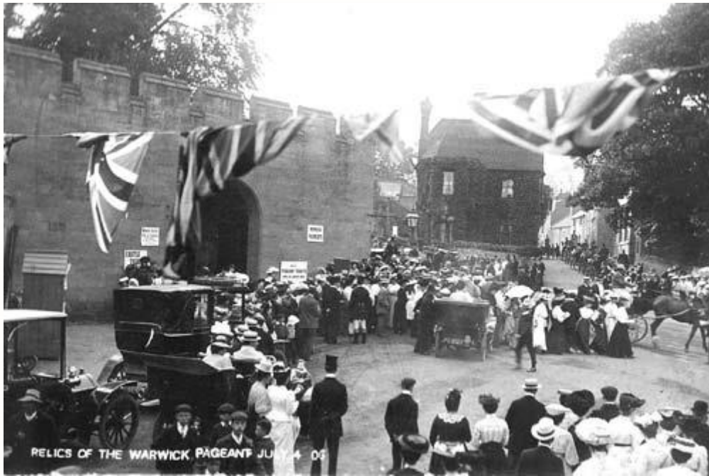
Relics of the Warwick Pageant, Image courtesy of Warwickshire County Record Office, PH352/187/59.

We have also chosen this postcard of relics of the Warwick Pageant dated July 4 th , 1906 (catalogue reference PH352/187/59). The postcard shows the crowds attending the pageant outside the Castle gates and on Castle Hill in Warwick. It was obviously a very well attended event, judging by the crowds in the photograph!