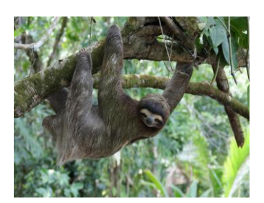
Sloths sleep around 10 hours a day.