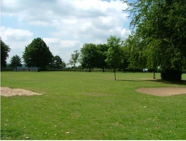
The school field