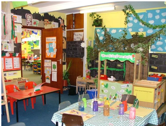
The practical area