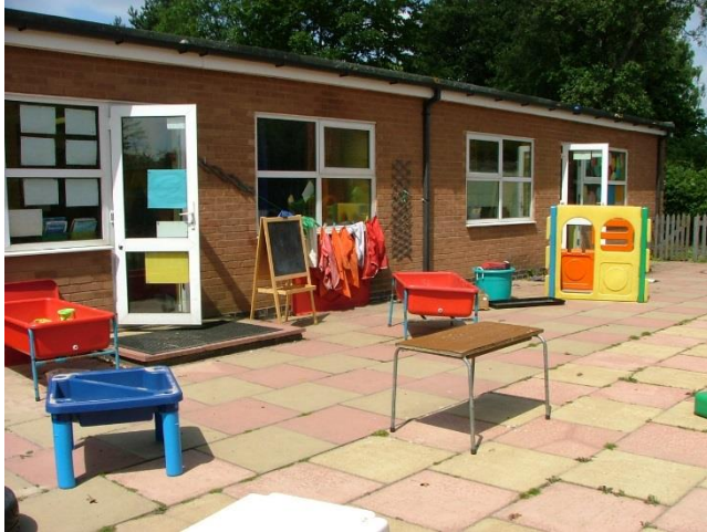
The outdoor play area