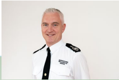
Chief Fire Officer Warwickshire Fire and Rescue Service