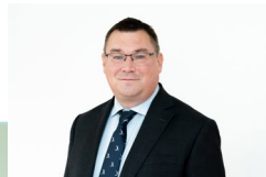
Director of Economy & Place