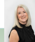
Coventry & Warwickshire Business Partnerships Strategic Lead