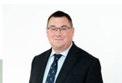
Director of Economy & Place