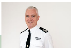
Chief Fire Officer Warwickshire Fire and Rescue Service