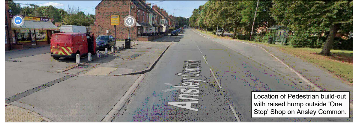
Location of Pedestrian build-out with raised hump outside 'One Stop' Shop on Ansley Common.