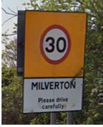
Existing 30 sign and 2 posts to be removed as shown.