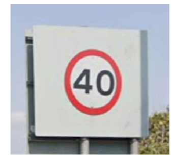
Existing 40 sign to be removed as shown.