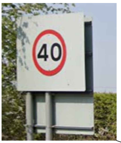
Existing 40 sign to be removed as shown.