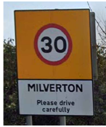
Existing 30 sign and 2 posts to be removed as shown.

Proposed Tye 2 tapered top road hump. Refer to standard detail plan C-006. This is located 75m from the previous raised hump on Old Milverton Road as shown.