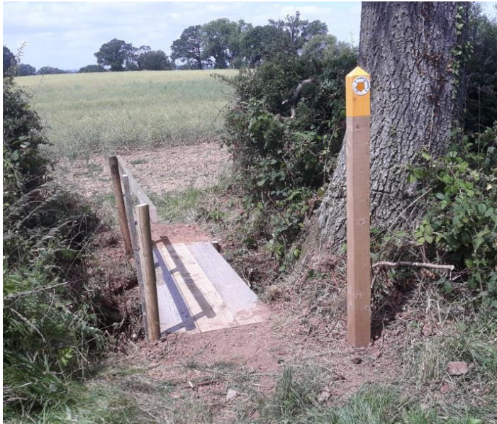
Figure 6 - Coventry Ramblers