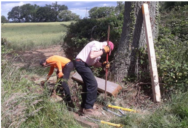
Figure 5 - Coventry Ramblers