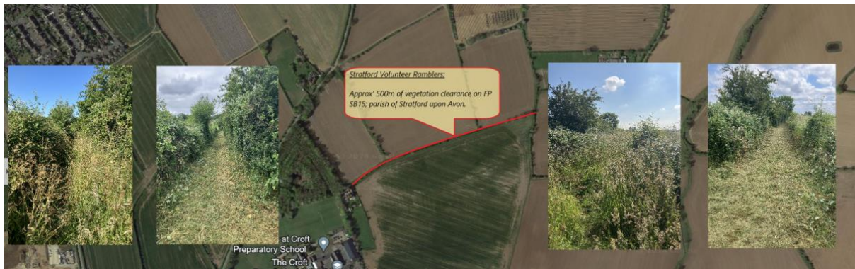
Figure 2 - Stratford Volunteer Ramblers