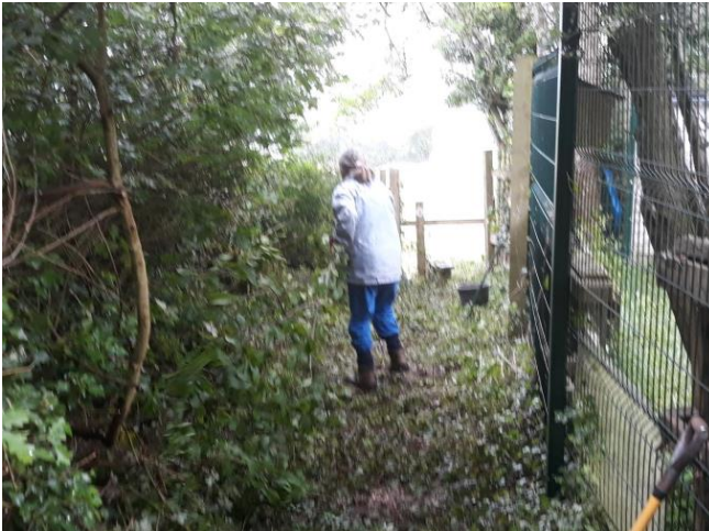
Figure 4 - Coventry Ramblers