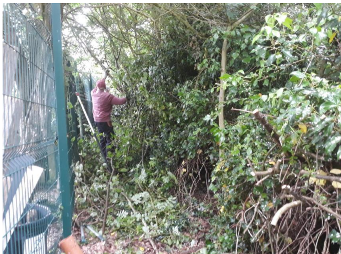
Figure 3 - Coventry Ramblers