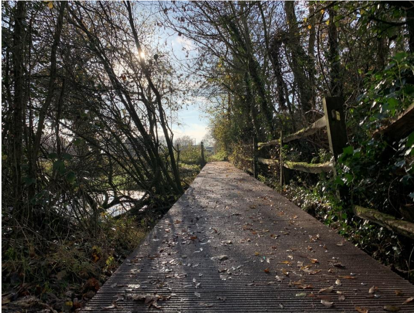
New Boardwalk at Harvest Hill