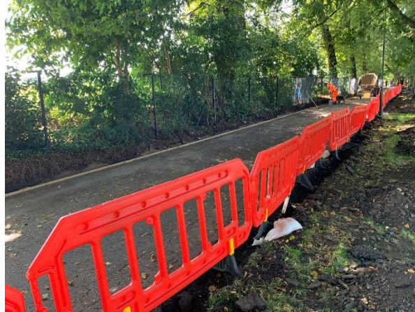
Spencer Park before and during the works