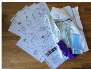
Dentist role play resource