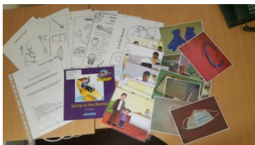
Going to the dentist story book resource

The WSCDS also has a small selection of resources that can be loaned, free, for a 2 week period: