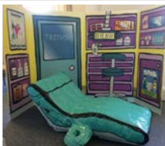
Inflatable chair and surgery background