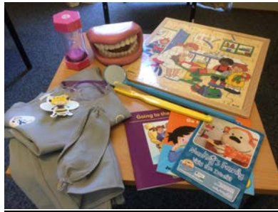
Oral Health Resource Box

To support the Oral Health eLearning programme resource pack and to enrich your oral health sessions or activities the Warwickshire Special Care Dental Service (WSCDS) has a WSCDS Oral Health Resource box that can be loaned free.