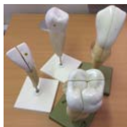
Teeth model set, x1 incisor, canine, pre-molar and molar tooth