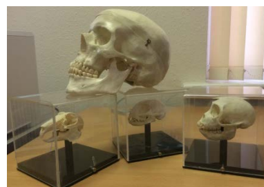
Skull model set