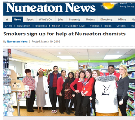
No Smoking Day 2016—coverage in Nuneaton News

Kasli take every opportunity to promote their stop smoking service and one of the main events they focus on is No Smoking Day every March. For the past 2 years they have been awarded first prize in the "Best Pharmacy Activity" in the national Organiser of the Year Awards.