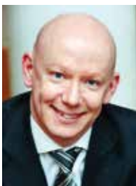
Chief Executive, Coventry City Council National Procurement Champion

This is the right strategy for our times and no council can afford to ignore it. I whole-heartedly commend it to you.