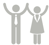
Be the best we can be