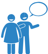
Do what we say