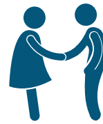
Build strong working relationships