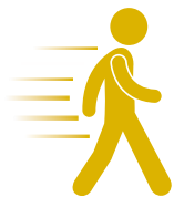
Move with purpose and energy