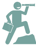
Focus on solutions