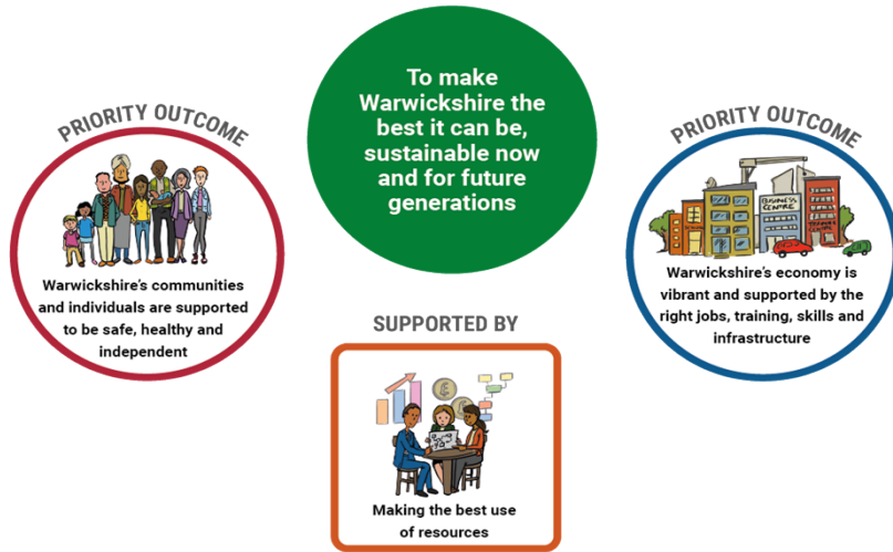
Figure 2: The Council's Core Purpose and Priority Outcomes

The Annual Governance Statement provides assurances that these processes are working in practice and provide services in line with our priorities by delivering on our supporting priority of Making the Best Use of Resources.