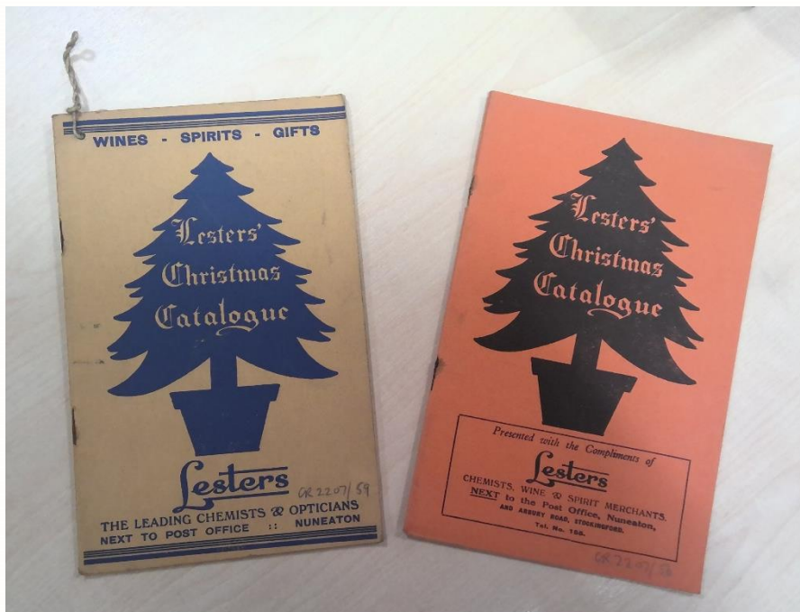
Two of the Christmas catalogues, Warwickshire County Record Office, CR2207/53-59

With December seeing the arrival of the festive season, and typically being a time for nostalgia, the choice for Document of the Month is these Christmas catalogues for Lester's Chemist in Nuneaton.