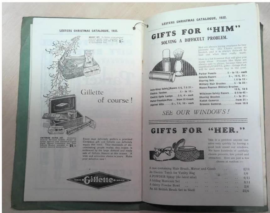
Gift ideas for "Him" and "Her"

For shoppers who were unsure what to buy for their family and friends, Lester's compiled handy lists of gift ideas for him and for her in the 1932 catalogue. Men's gift ideas include safety razors and shaving brushes, whilst women's included manicure sets and powder bowls. Always useful!