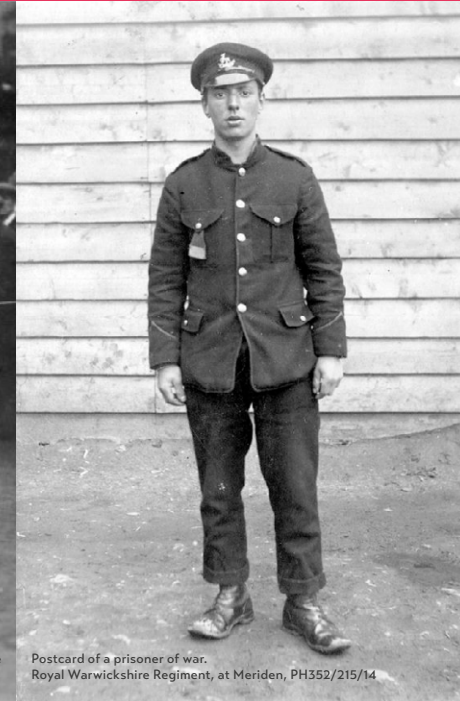
Postcard of a prisoner of war. Royal Warwickshire Regiment, at Meriden, PH352/215/14