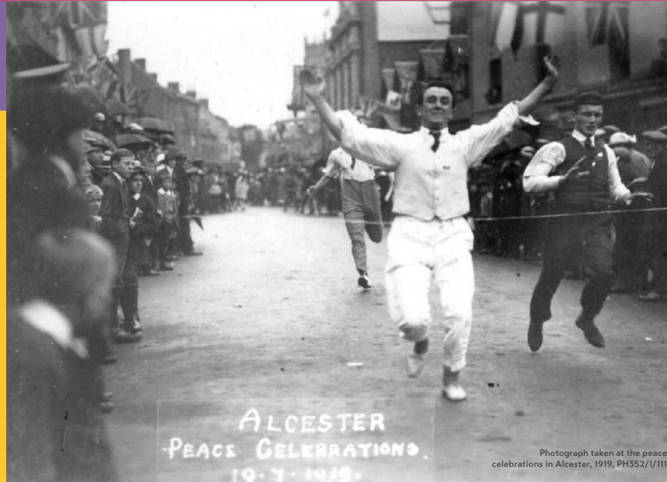
Photograph taken at the peace celebrations in Alcester, 1919, PH352/1/111

See documents highlighting the role of the Red Cross, the enlisting of men and horses and the cases of conscientious objectors. Read postcards and letters sent home from the front, as well as documents highlighting the effects on the Home Front. On the theme of peace and remembrance, see documents giving us a glimpse into the lives of injured and disabled soldiers after they were discharged.