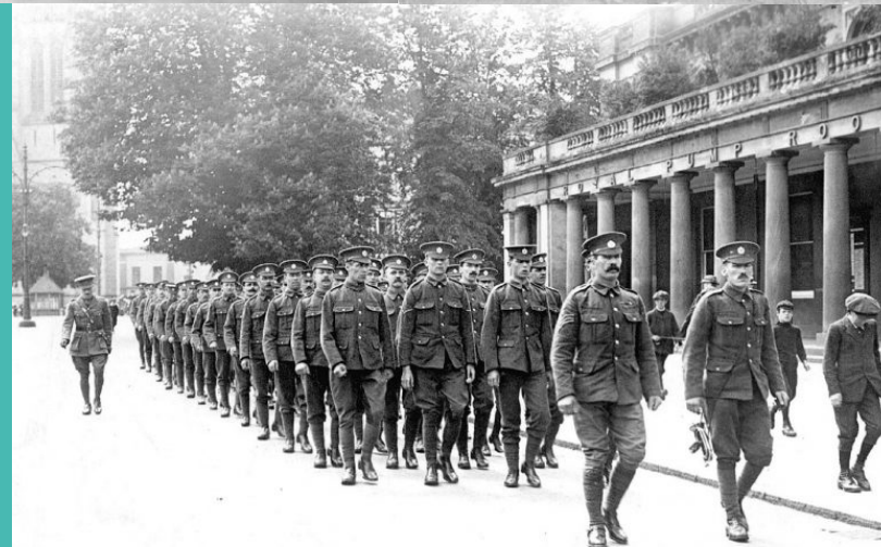
Postcard of Soldiers marching past Pump Rooms, Leamington Spa. PH352/111/100