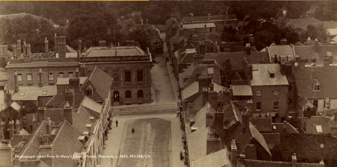
Photograph taken from St Mary's Church Tower, Warwick, c. 1895, PH1298/1/5.