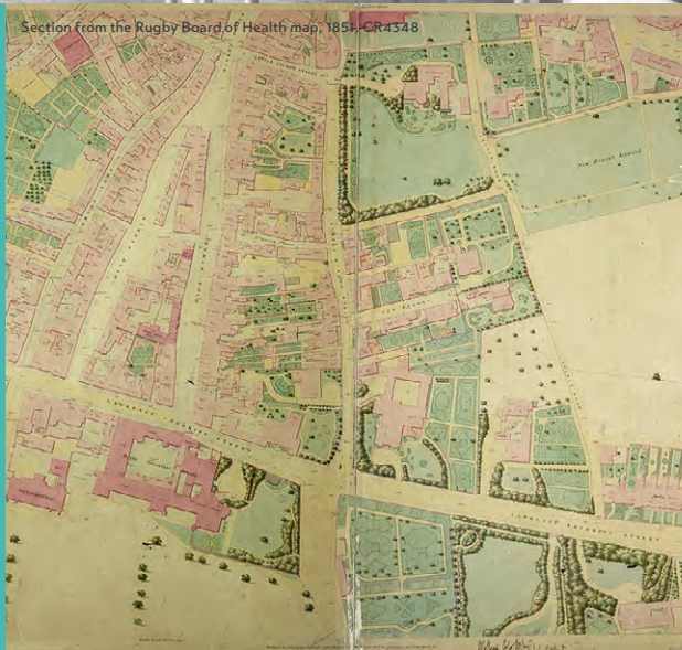
Section from the Rugby Board of Health map, 1851. CR4348

See birth and death registers from parish records, hospital records, handwritten household recipe books with recipes and cures for illnesses, newspaper articles and adverts.