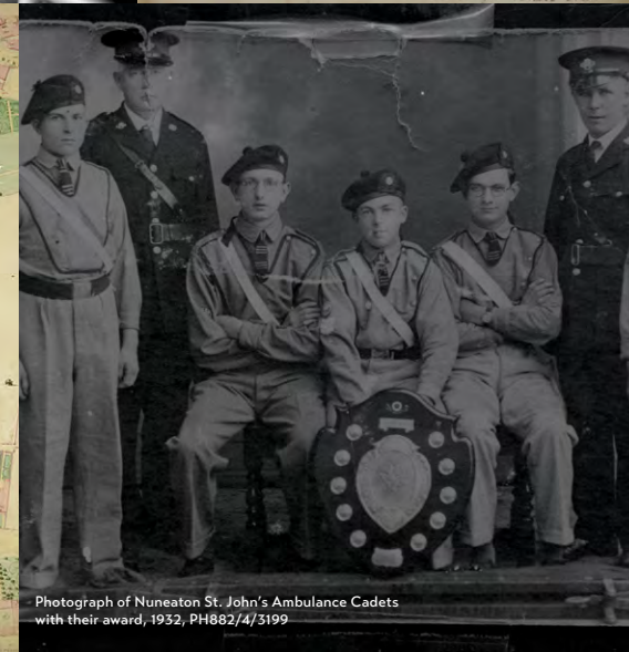
Photograph of Nuneaton St. John's Ambulance Cadets with their award, 1932, PH882/4/3199