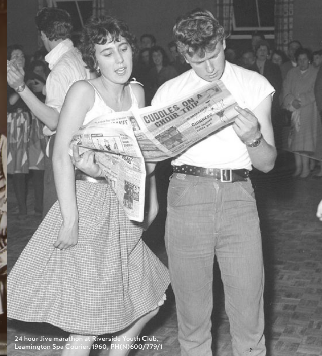
24 hour Jive marathon at Riverside Youth Club, Leamington Spa Courier, 1960, PH(N)600/779/1