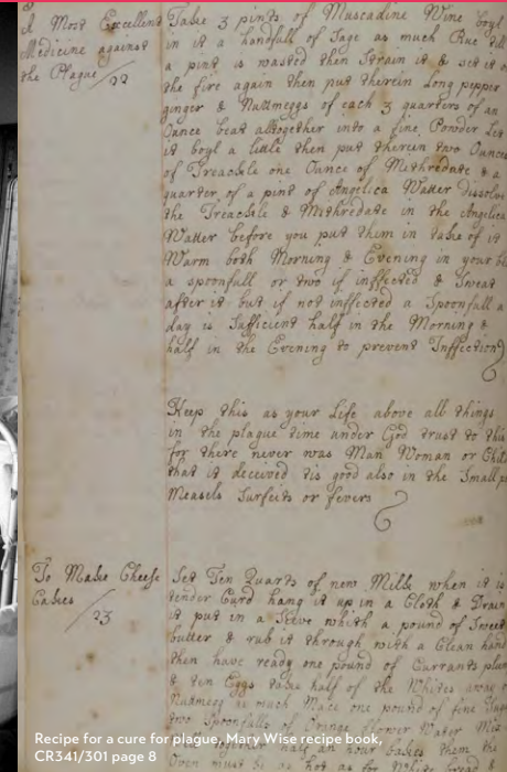
Recipe for a cure for plague, Mary Wise recipe book, CR341/301 page 8