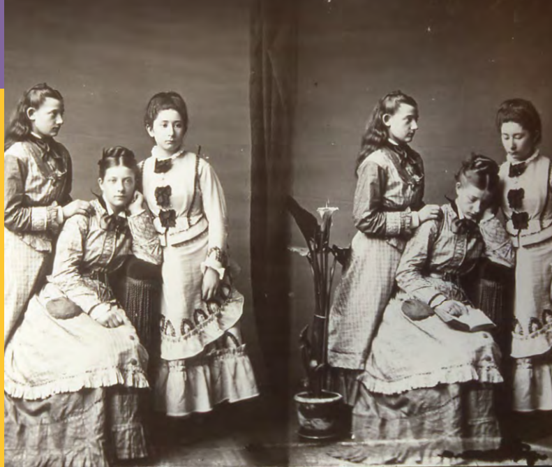
Portrait of three girls taken at the Robert Graham studio, Leamington Spa, 1876, CR2555/3157