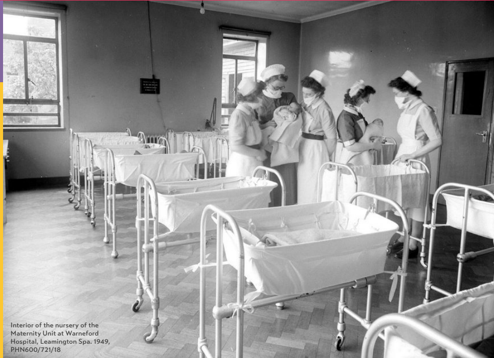
Interior of the nursery of the Maternity Unit at Warneford Hospital, Leamington Spa, 1949. PHN600/721/18