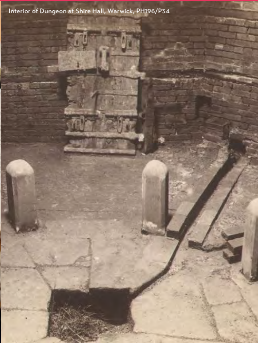
Interior of Dungeon at Shire Hall, Warwick, PH196/P34