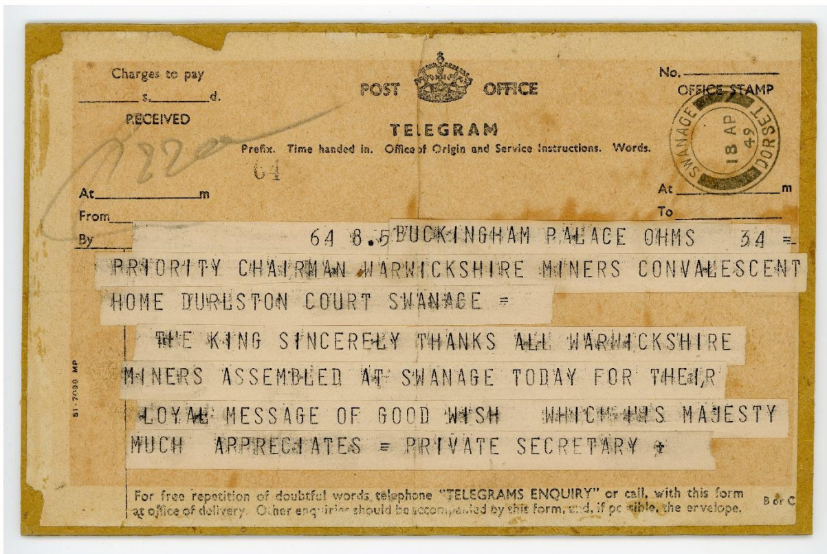
Figure 1: Warwickshire County Record Office, CR3323/887/1

The Document of the Month for July is a selection of three telegrams sent to the Chairman of Warwickshire Miners' Convalescent Home in Swanage, Dorset, on the occasion of its grand opening in 1949.