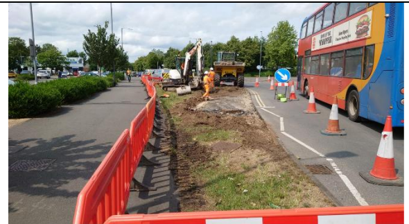
Works have commenced at Regal Road and temporary traffic management has been set up.

The General Arrangement drawings of the new Phase 3 road layout are available to view at the following links: