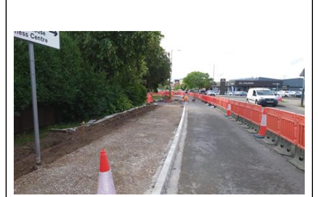
Kerbs being installed from Oakleigh Road until Justins Avenue.

Carriageway widening works also commenced at Regal Road Roundabout on 2nd June 2025 on the northbound approach from Wharf Road, under temporary traffic management