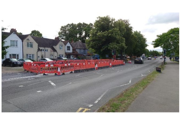
Barriers around the excavation.