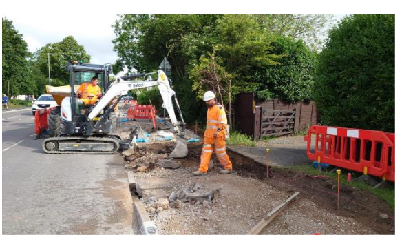
Excavation works taking place.