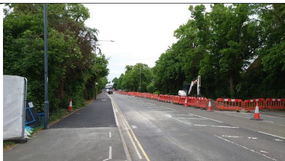
Footway works on the inbound have been completed and works have now commenced on the outbound lane.