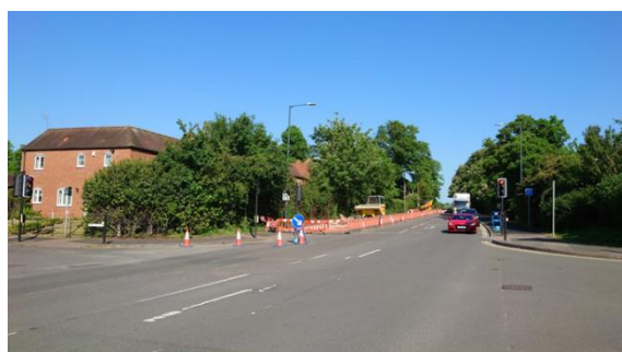
Traffic management layout from St Peter's Way to The Avenue.