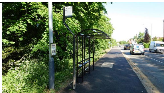
New bus shelter installed opposite the Veterinary Practice.

The works are currently being undertaken from St Peter's Way to Joseph Way on the outbound footway and involves removal of existing tarmac layer, replacement of existing kerbs with drainage kerbs and resurfacing.