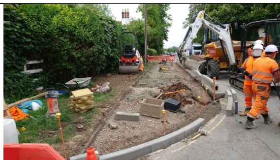
Current works being undertaken from St Peter's Way to Joseph Way which involves replacement of existing kerbs with drainage kerbs.