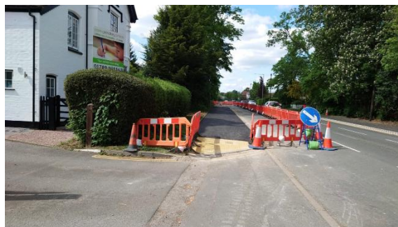
New tactiles have been installed on the outbound footway.