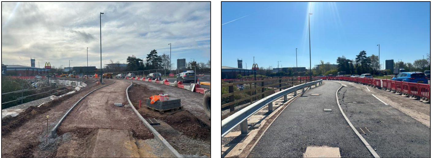
Figure 5 Phase F - Progress (Before & After)

Throughout March, several activities were completed on Phase F bringing it close to completion and reopening to the public. The steel Vehicle Restraint System (VRS) barrier was installed which was over 90m in length. To ensure the VRS was installed correctly and conformed to all of the stringent standards in place, it was static push tested with a specialised push test rig, in which it passed. For additional pedestrian safety, a timber post and rail fence was also installed, see Figure 5.