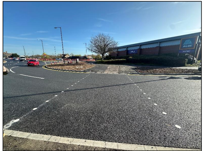
Figure 10 Phase B – New Pedestrian crossing