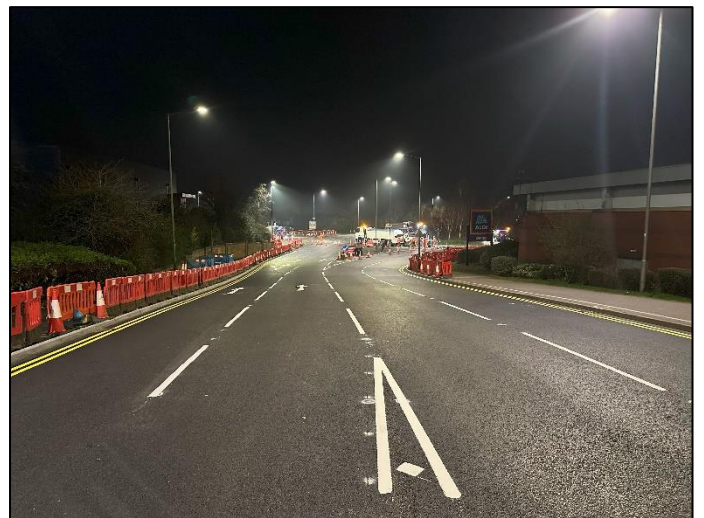
Figure 4 – Line Painting

Due to the efficiency and planning from Allroad Asphalt Solutions, Warwickshire County Council and CR Reynolds, surfacing was completed before schedule and has been opened to the public. The area is now ready for signalisation, which is planned for installation during June.