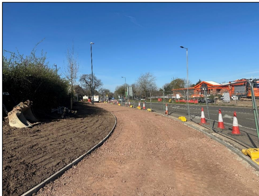
Figure 9 Phase H – Widened footpath

The new widened footpath leading into Myton Road has also been fully edge kerbed and the main path brought to level ready for the binder course of tarmac in May, see Figure 9.