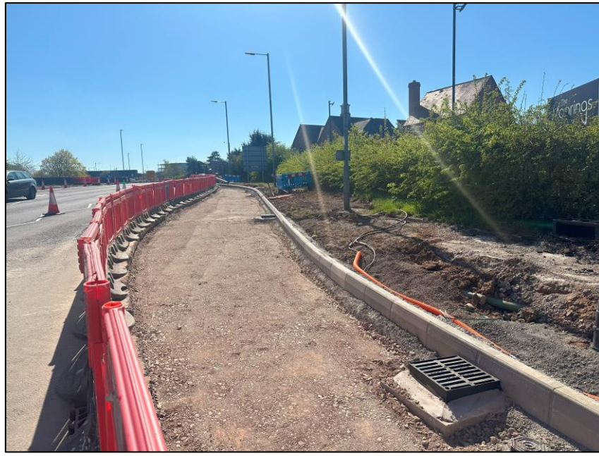
Figure 8 Phase H – New Kerb Alignment

Works on Phase H progressed throughout the month, with the completion of the new widened southern kerbline. The new kerbs now allow for the upper carriageway structural layers to be laid ready for the binder course of tarmac in May, see Figure 8.