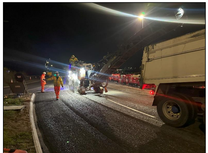
Figure 2 Planing Existing Road Surface