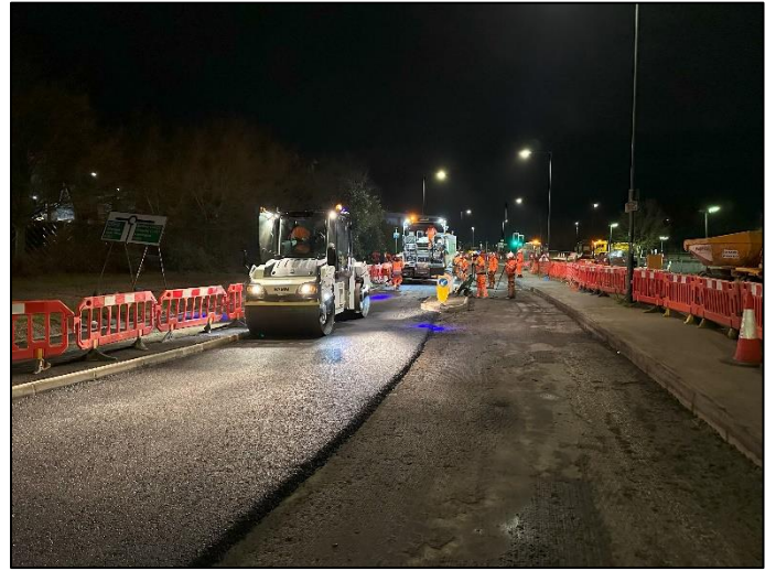
Figure 3 - Tarmac Surfacing

Following completion of the surfacing, the area was ready for the new and improved white lining design to be applied to the road surface using highly durable thermoplastic line paint, see Figure 4. The new lining layout maximises the increased lane width and additional lane achieved from the size reduction of Queensway Roundabout which completed in Autumn 2024.