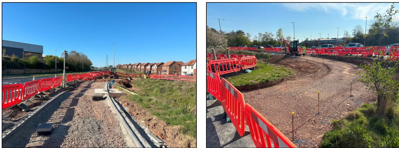
Figure 7 Phase J – Europa Way New Pedestrian Crossing Point

The leadup to the crossing point was constructed using structural stone to bring the path to the correct gradient for accessibility standards. Once at level, the laying of the new edge kerbs was started and the street lighting column bases installed, see Figure 7.