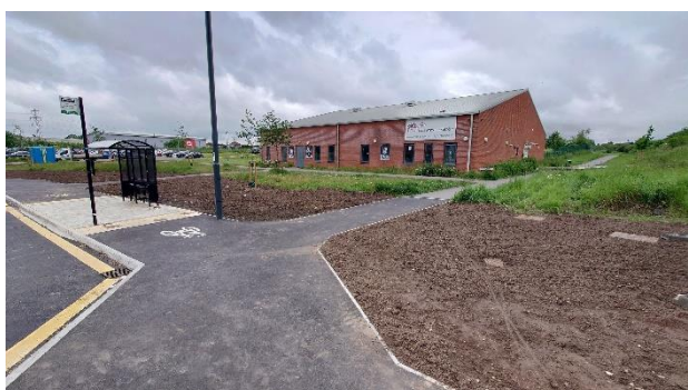
Bermuda Road / Bermuda Village Junction