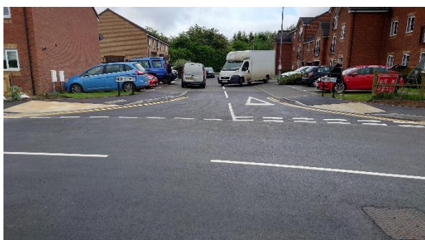
Bermuda Road / Rider Close Junction