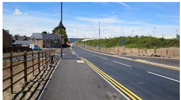
Barling Way and The Bridleway