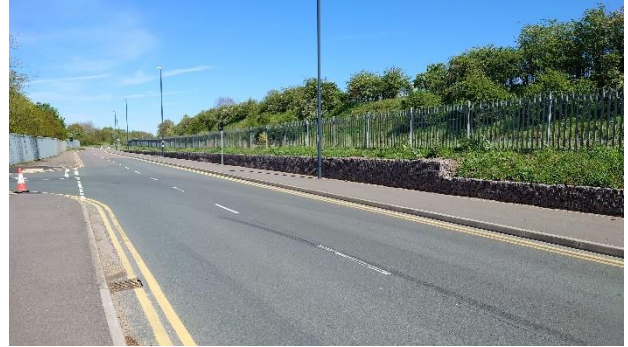
Eastern and Western approaches

All works are completed, and the scheme will be opened to all traffic from Friday 31-May-2024.