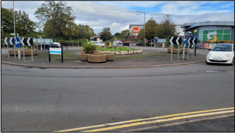
Opportunity to soft landscape roundabout, potentially incorporating rain garden planting.