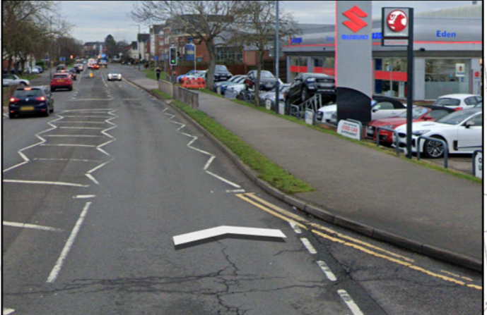
Rain garden / swale to replace verge.