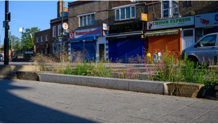
White Hart Lane- Robert Bray Associates