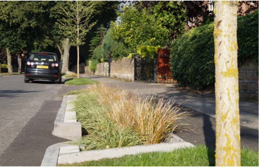
Greening streets, retrofit rain gardens, Nottingham (susdrain.org)