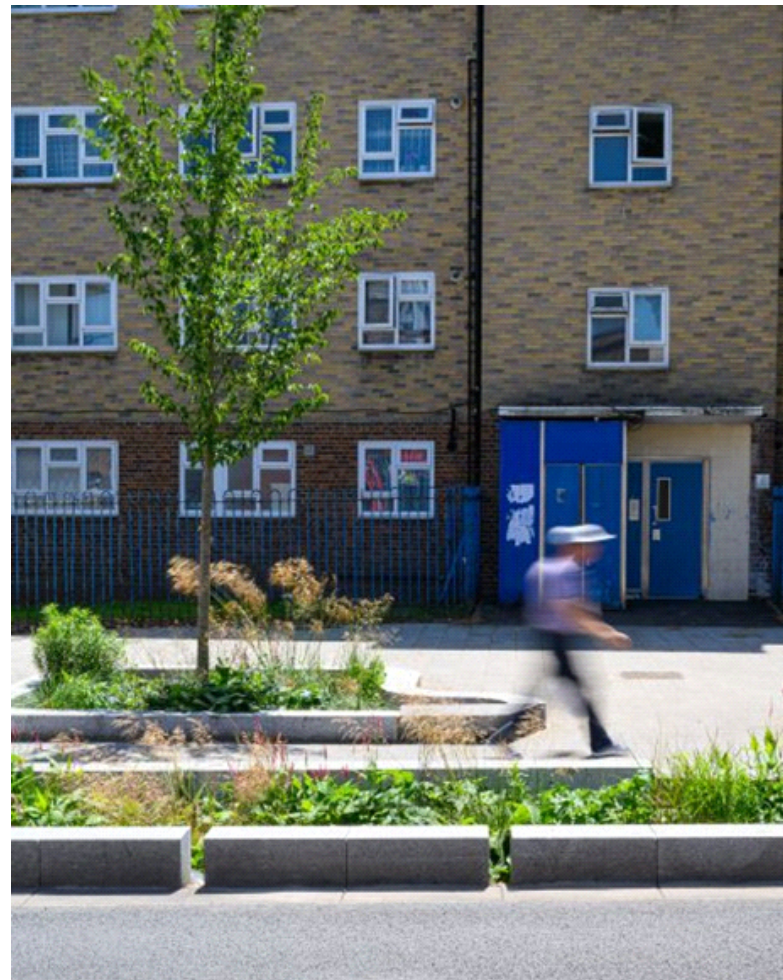
White Hart Lane- Robert Bray Associates