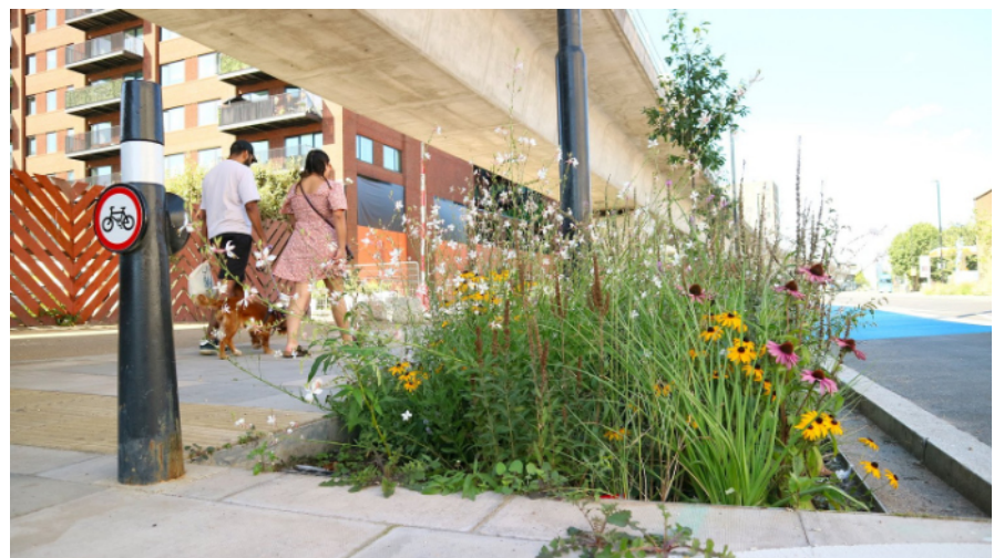
Royal Docks Corridor - Meristem Designs