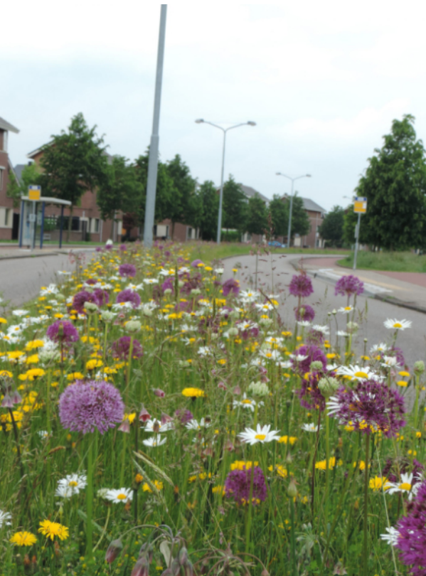
Mix of native and non-native planting in verge strips to provide diversity for pollinators. Plantlife