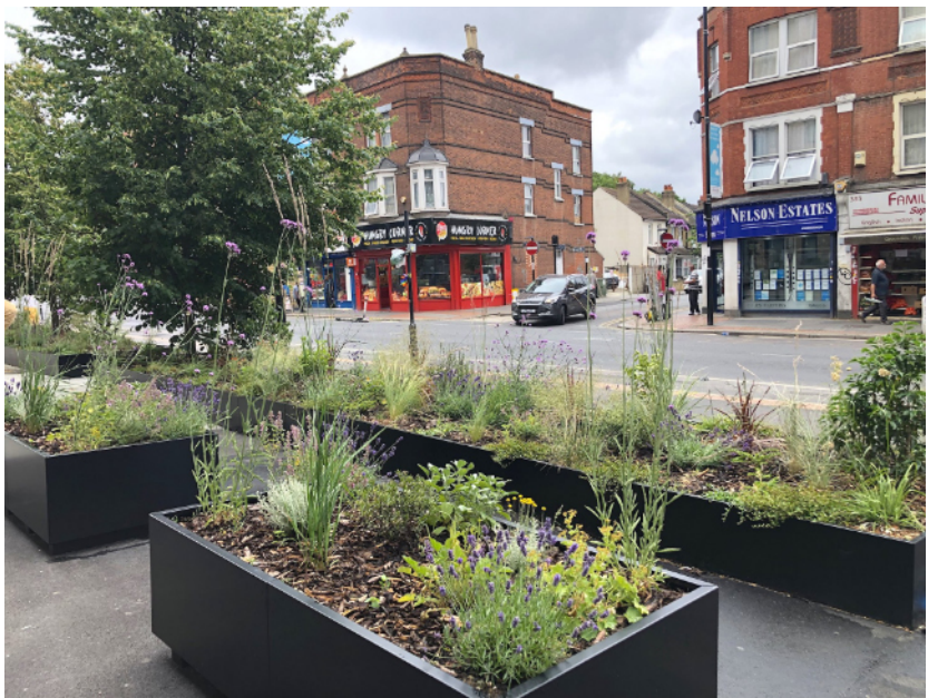
Rain Garden Planters, Croydon - Meristem Designs