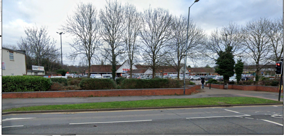
Vegetation removal around new lane layout to Tesco (tbc). Opportunity for soft landscaping depending on final layout