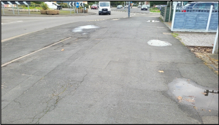
Rain gardens and other landscaping used to direct vehicles from residential driveways and prevent parking on pavement. Consideration needed of best access to limit conflict between pedestrians and cyclists with vehicles.