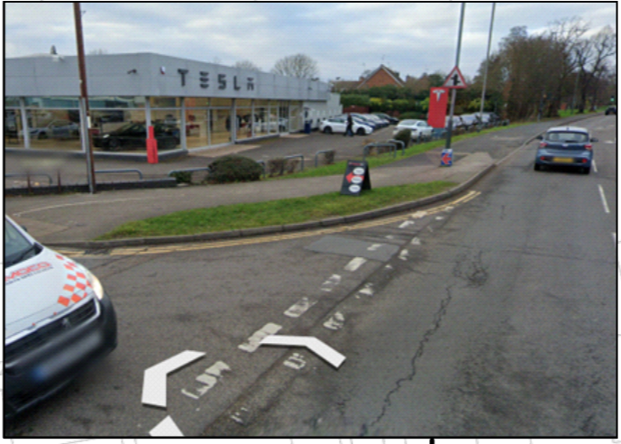
Diversify existing verge.