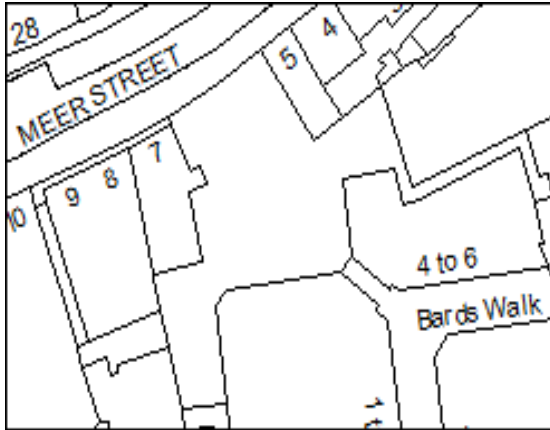
Bards Walk Service Area