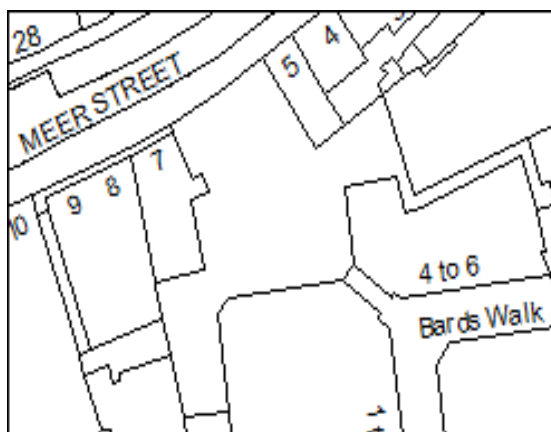
Bards Walk Service Area

I have the use of an off-street parking/garaging facility at the location marked on the appropriate plan below: