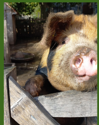
Meeting the locals at Mary Arden's Farm