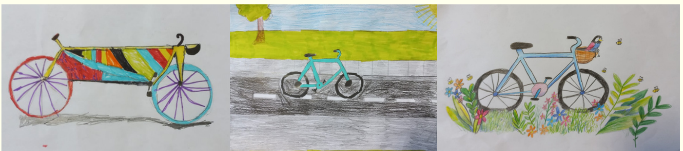
Coten End Primary School has created some beautiful drawings of bikes to celebrate the Commonwealth Games Road Races coming to Warwick. These will be on display at Warwick Station for all to see!

Alternatively, get in touch and we can help to research funding opportunities that are available for station volunteers and for projects you may wish to partner with us on.