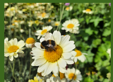
Happy bees at Widney Manor Station