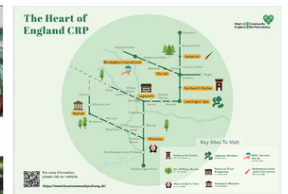
Digital version of my map.