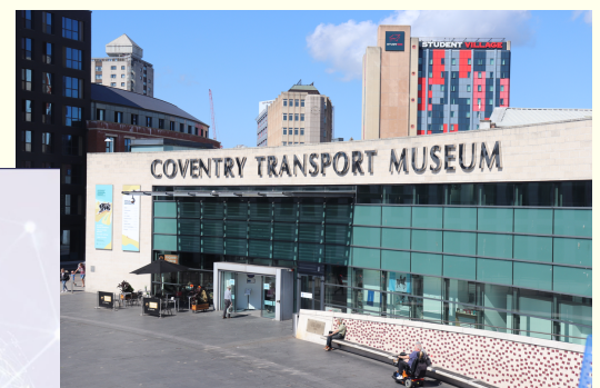
Playhem at the Promenade with Coventry Transport Museum.