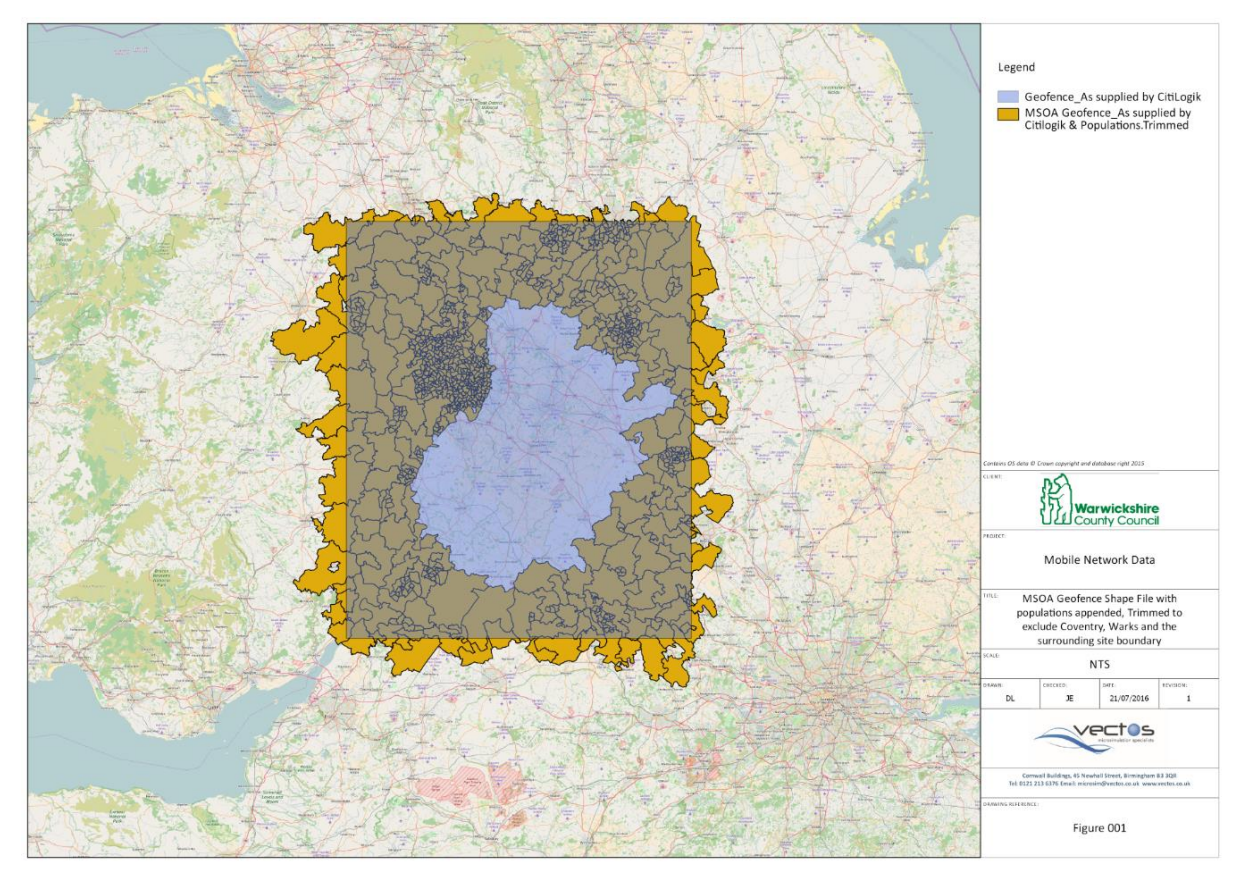
Figure 1: MND Coverage