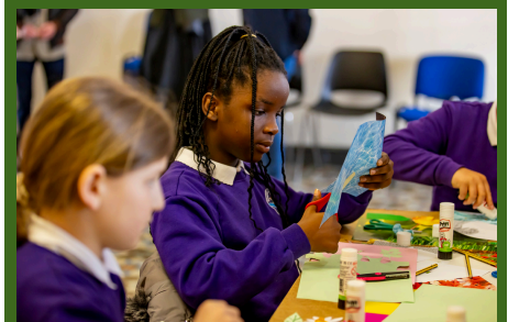
Schools receiving a free art workshop at our Rugby Colour Palette Launch