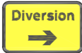
Sign 4 - Ref 2702