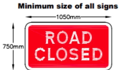
Sign 1 - Ref 7010.1