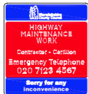
Sign 8 - Ref 7008