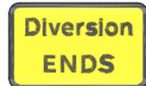
Sign 6 - Ref 2702