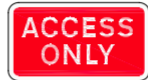
Sign 3 - Ref 7010.1