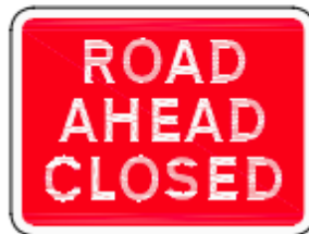
Sign 2 - Ref 7010.1