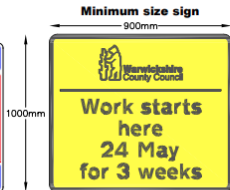
Sign 9 - Ref 7003.1