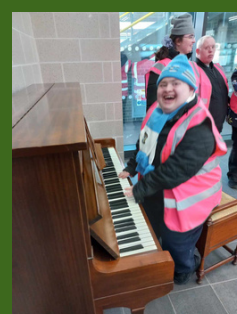
Our Coventry Adopters trying out the new station piano