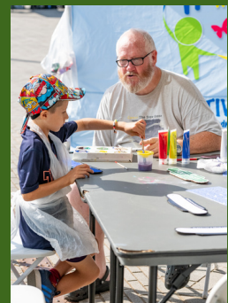
Fun at our Community Day in September