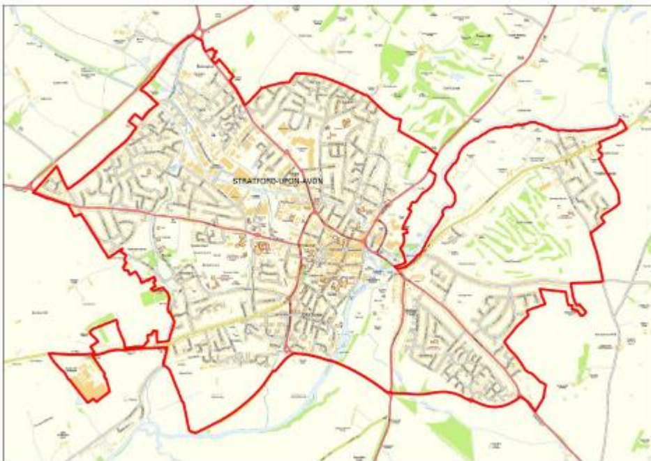
Figure 1: Stratford-on-Avon Air Quality Management Area (AQMA) boundary

Road transport is the main contributor of polluting emissions. Transport infrastructure and behavioural change measures that reduce congestion, improve traffic flows and encourage modal shift to sustainable modes of travel will be key to achieving an acceptable level of air quality in Stratford-upon-Avon whilst providing benefits to public health and the economy. Any development proposals for the town will need to show that air quality will not deteriorate as a result, in line with the Air Quality Strategy in Warwickshire County Council's Local Transport Plan (2011-2026).