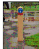
Glenwood - Glenwood Timber type 170 post bollard, with shared Cycleway & Ped. Logo to the front and back. (Dia. 956 of TSRGD 2016)