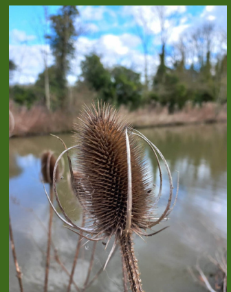
Appreciating nature on our Rugby Rail Trail as part of the Curious Trails project