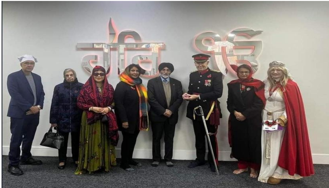
Images of the first Commonwealth Remembrance service held in Foleshill Peace Park. Acknowledging Sikhs by placing romalla sahib at Ravidass Gurdwara and gurdwara presenting a khanda poppy.